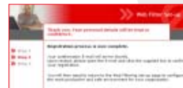
Business user screen

Having sent your details, a registration screen will appear on your computer screen.