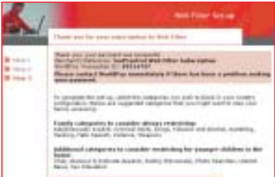
Home user screen

You will receive an e-mail from WorldPay to confirm your transaction. Please keep this e-mail for your records.