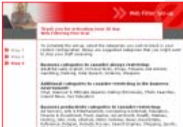
Business user screen

Your subscription is now complete. You will receive an e-mail from PowerNetIX to confirm your subscription.