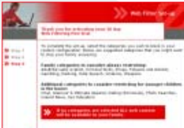
Home user screen