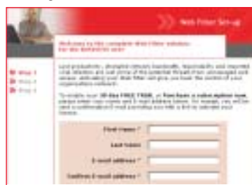
Business user screen

Enter your name and e-mail address and subscribe to SurfControl