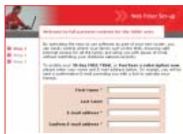
Home user screen