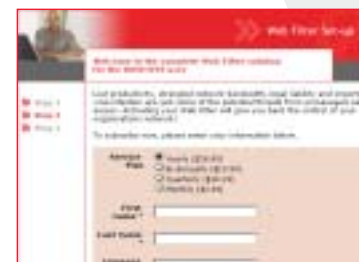
Business user screen