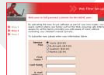
Home user screen