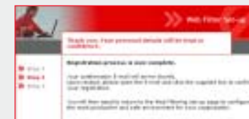
Home user screen