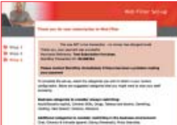
Business user screen